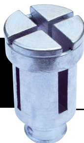
Wire & chain adapter included.

Versatility comes from the unique adapter heads that are specific to each application.