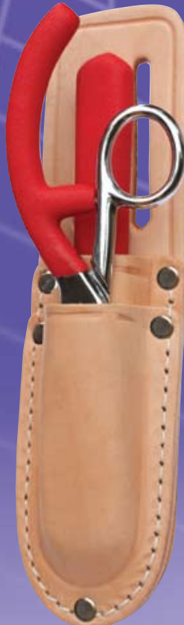
Leather Pouch, Knife & Scissors Kit