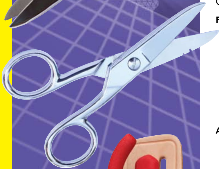
Scissor-Run and Free-Fall Scissors